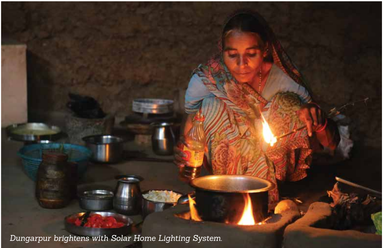
Dungarpur brightens with Solar Home Lighting System.